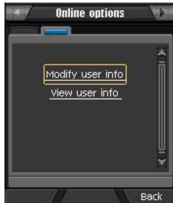
Online Options UI