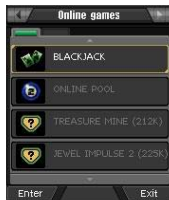
MGS Online Games List