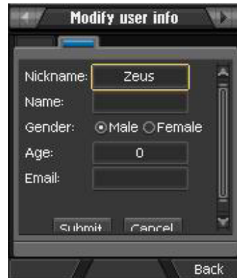
Modify User Info UI